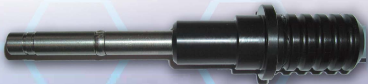
Olympus High Intensity