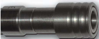
ACMI / British Standard \varnothing 7.5mm